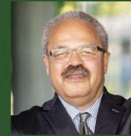
LEW FREDERICK Oregon State Senator